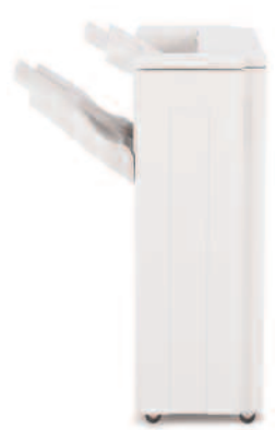
1,000-Sheet Finisher (SR790)