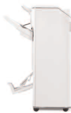
2,000-Sheet Booklet Finisher (SR3020)