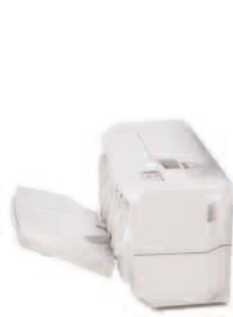
500-Sheet Finisher (SR3010)

A variety of finishing options to meet your needs.