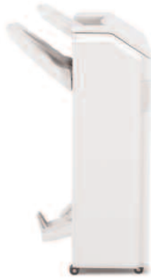
1,000-Sheet Booklet Finisher (SR3000)