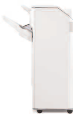
3,000-Sheet Finisher (SR3030)